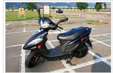
A modern scooter in Taiwan.

While intermittent internal combustion engines were once the primary means of aircraft propulsion, they have been largely superseded by continuous internal combustion engines: gas turbines. Turbine engines are light and, particularly when used on aircraft, efficient. On the other hand, they cost more and require careful maintenance. They also get damaged from ingesting foreign objects and produce a hot exhaust. Trains using turbines are called gas turbine-electric locomotives. Examples of surface vehicles using turbines include M1 Abrams, MTT Turbine SUPERBIKE and the Millennium. Pulse jet engines are similar in many ways to turbojets, but have almost no moving parts. For this reason, they were very appealing to vehicle designers in the past, however their noise, heat and inefficiency has led to their abandonment. A historical example of a pulse jet in use was the V-1 flying bomb. Pulse jets are still occasionally used in amateur experiments. With the advent of modern technology, the pulse detonation engine has become practical and was successfully tested on a Rutan VariEze. While the pulse detonation engine is much more efficient than the pulse jet and even turbine engines, it still suffers from extreme noise and vibration levels. Ramjets also have few moving parts, but they only work at high speed meaning that their use is restricted to tip jet helicopters and high speed aircraft such as the Lockheed SR-71 Blackbird. [40][41]