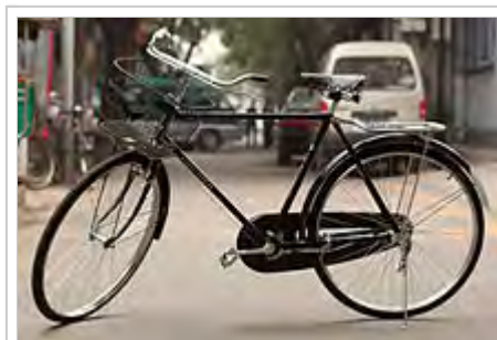
The most common model of vehicle in the world, the Flying Pigeon bicycle.