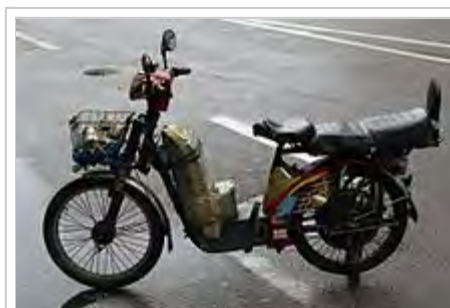
An electric bike in China