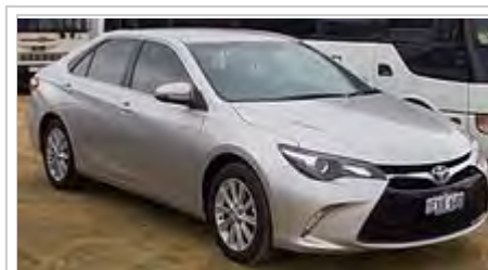
Automobiles are among the most commonly used engine-powered vehicles

Another common medium for storing energy are batteries, which have the advantage of being responsive, useful in a wide range of power levels, environmentally friendly, efficient, simple to install and easy to maintain. Batteries also facilitate the use of electric motors, which have their own