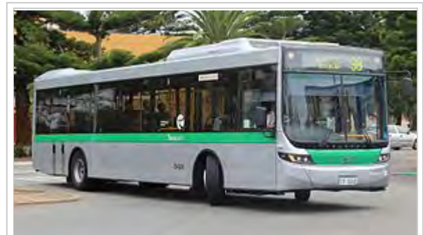
Buses are a common form of vehicles used for public transport

Land vehicles are classified broadly by what is used to apply steering and drive forces against the ground: wheeled, tracked, railed or skied. ISO 3833-1977 is the standard, also internationally used in legislation, for road vehicles types, terms and definitions. [3]