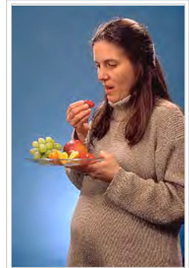
Pregnant woman eating fruit.

Nutrition and pregnancy refers to the nutrient intake, and dietary planning that is undertaken before, during and after pregnancy. Nutrition of the fetus begins at conception. For this reason, the nutrition of the mother is important from before conception (probably several months before) as well as throughout pregnancy and breast feeding. An ever-increasing number of studies have shown that the nutrition of the mother will have an effect on the child, up to and including the risk for cancer, cardiovascular disease, hypertension and diabetes throughout life.