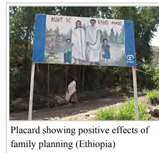
Placard showing positive effects of family planning (Ethiopia)

There are two types of surrogacy: traditional and gestational. In traditional surrogacy, the surrogate uses her own eggs and carries the child for her intended parents. This procedure is done in a doctor's office through IUI. This type of surrogacy obviously includes a genetic connection between the surrogate and the child. Legally, the surrogate will have to disclaim any interest in the child to complete the transfer to the intended parents. A gestational surrogacy occurs when the intended mother's or a donor egg is fertilized outside the body and then the embryos are transferred into the uterus. The woman who carries the child is often referred to as a gestational carrier. The legal steps to confirm parentage with the intended parents are generally easier than in a traditional because there is no genetic connection between child and carrier. [15]