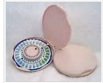
Combined oral contraceptives. Introduced in 1960, "the Pill" has played an instrumental role in family planning for decades.

Family planning , simply put, is the practice of controlling the number of children in a family and the intervals between their births, particularly by means of artificial contraception or voluntary sterilization. Because "family" is included in the concept's name, consideration of a couple's desire to bear children, in the context of a family unit, is often considered primarily. Contemporary notions of family planning, however, tend to place a woman and her childbearing decisions at the center of the discussion, as notions of women's empowerment and reproductive autonomy have gained traction in many parts of the world. Family planning may involve consideration of the number of children a woman wishes to have, including the choice to have no children, as well as the age at which she wishes to have them. These matters are obviously influenced by external factors such as marital situation, career considerations, financial position, any disabilities that may affect their ability to have children and raise them, besides many other considerations. If sexually active, family planning may involve the use of contraception [1][2] and other techniques to control the timing of reproduction. Other techniques commonly used include sexuality education, [2][3] prevention and management of sexually transmitted infections, [2] pre-conception counseling [2] and management, and infertility management. [1]