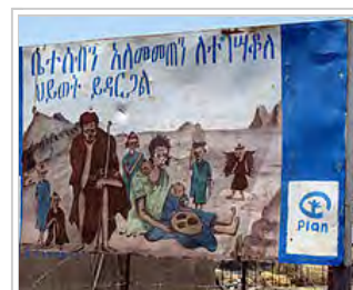
Placard showing negative effects of lack of family planning and having too many children and infants (Ethiopia)