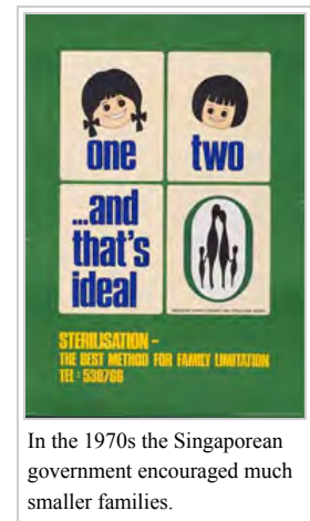
In the 1970s the Singaporean government encouraged much smaller families.

UNFPA says that “efforts to increase access must be sensitive to cultural and national contexts, and must consider economic, geographic and age