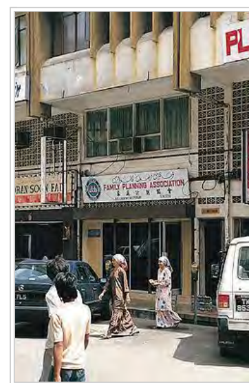
A family planning facility in Kuala Terengganu, Malaysia

China's Family planning policy forced couples to have no more than one child. Beginning in 1979 and being officially phased out in 2015, [34] the policy was instated to control the rapid population growth that was occurring in the nation at that time. With the rapid change in population, China was facing many impacts, including poverty and homelessness. As a developing nation, the Chinese government was concerned that a continuation of the rapid population growth that had been occurring would hinder their development as a nation. The process of family planning varied throughout China, as people differed in their responsiveness to the one-child policy, based on location and socioeconomic status. For example, many families in the cities accepted the policy more readily based on the lack of space, money, and resources that often occurs in the cities. Another example can be found in the enforcement of this rule; people living in rural areas of China were, in some cases, permitted to have more than one child, but had