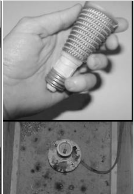
Left: The dryer cabinet and the polycarbonate trays. Right: The 600-watt ceramic heat coil screws into an ordinary porcelain lamp base.

Whatever the size or material of your trays, design the cabinet size around them allowing for sufficient room below for the heat element and room to easily fit the trays within. I am providing the measurements below to serve only as a guide for your own construction process, because the type and size of trays that you come up with may vary from that which I devised. Our dryer measures 48" tall by 14¾" wide by 16" deep. The trays themselves measure 13¾" square. A slightly different size tray is available from Excalibur Dehydrators, listed at the end of this article.